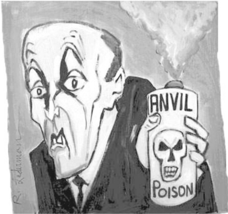
Painting of Giuliani by Robert Lederman

Instead of a pesticides hotline for people to call who were sickened by the spraying, the City Department of Health set up a “West Nile virus telephone answering service”. The No Spray Coalition taped some of these calls, and submitted transcripts of them as part of its lawsuit. These tapes show that the hotline was answered by ill-informed operators 200 miles away in Pennsylvania (non-unionized, which is one of the reasons the City outsourced this “service”), who were only allowed to take information from those suspected of having contracted West Nile virus; they refused to take information from callers who were sickened by the spraying itself, and had no advice to offer them.