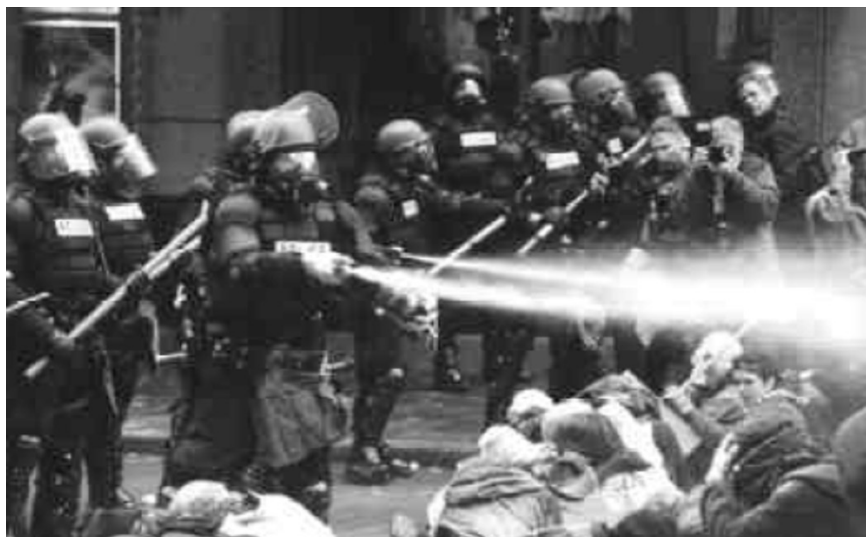
Seattle police spray teargas and mace laced with Malathion-like chemicals on non-violent protesters, Nov. 30 – Dec. 2, 1999.

for the moment, in large part due not only to the spirited protests (against which Malathion-like chemicals were added to the tear-gas being fogged by police), but to the African delegation's resistance to the stipulations requiring countries to accept genetically engineered crops and seeds. 61 For two years the movement, whose leading slogan was "Another World Is Possible," organized large and effective protests against the trade agreements and G-8 summits throughout the world, against which the police and military exploited the opportunity to test "non-lethal" weapons and deploy new policing methods and configurations of command.