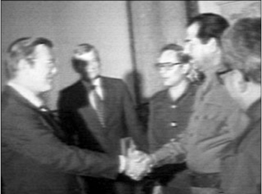
Donald Rumsfeld's famous handshake cementing trade agreements with Saddam Hussein in Iraq, circa 1983.

housed, a few floors above, the largest CIA offices in the country outside of Langley VA, and all the Securities and Exchange Commission files on Enron and other corporate scandals, which were scheduled to be heard shortly after 9/11. (Most of those files were destroyed in the attacks on the World Trade Center.) In the beginning Giuliani and others pinned the upsurge of mosquito-borne ailments and the handful of cases of West Nile encephalitis on Saddam Hussein, just as officials were later to claim – similarly,